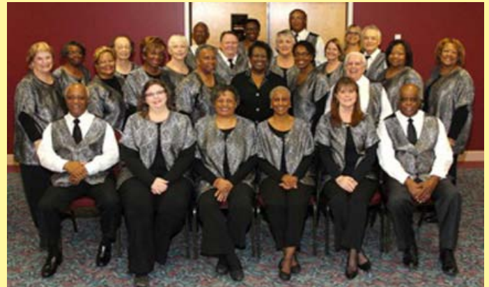
Gulf Coast Choir Sarasota