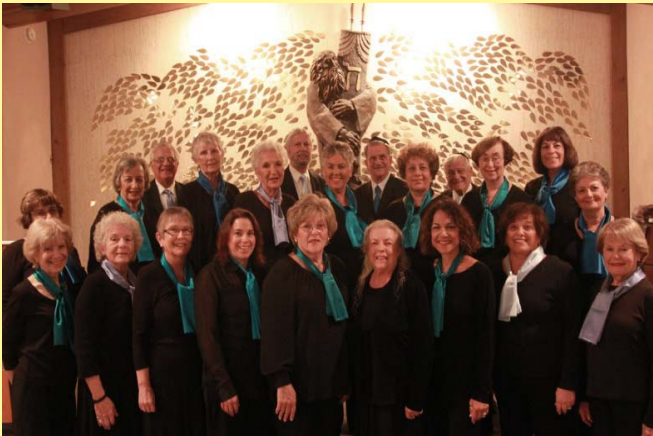
Sarasota Jewish Chorale