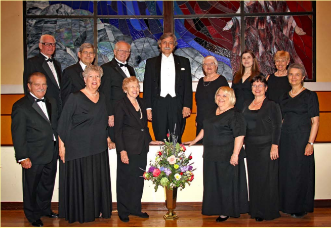
Bion Cantorum Port Charlotte

Most small choral groups aspire to grow large but many opt to remain small and in many cases focus on acappella singing where the musical challenges outweigh the thrill of large orchestral accompaniment. The smaller groups also enjoy a camaraderie quite different then a large chorus where it's difficult to know everyone. Singers become more conscious of their role and their contribution in the smaller chorus. Musically weak singers are not as apt to survive since more is expected of each voice. Shown on this page are some of the small ensembles that make up the choral family in southwest Florida.