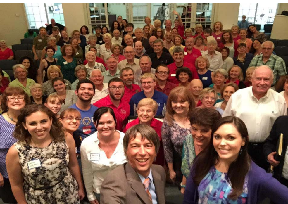
Summer Sing participants.