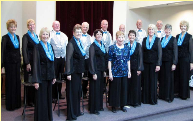
Soundsations Northport Chorale