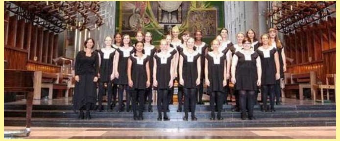
Sarasota Young Voices