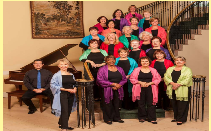
Belle Canto Sarasota